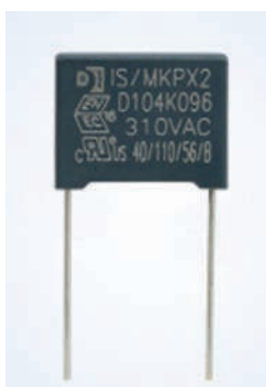
X-2 Capacitor (THB Grade)