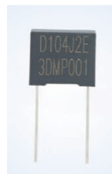
DC Filter Capacitor