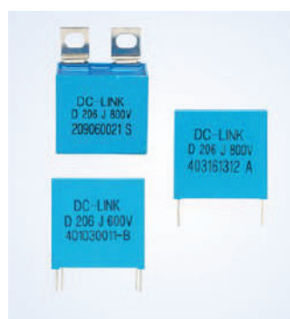
DC- Link Capacitor